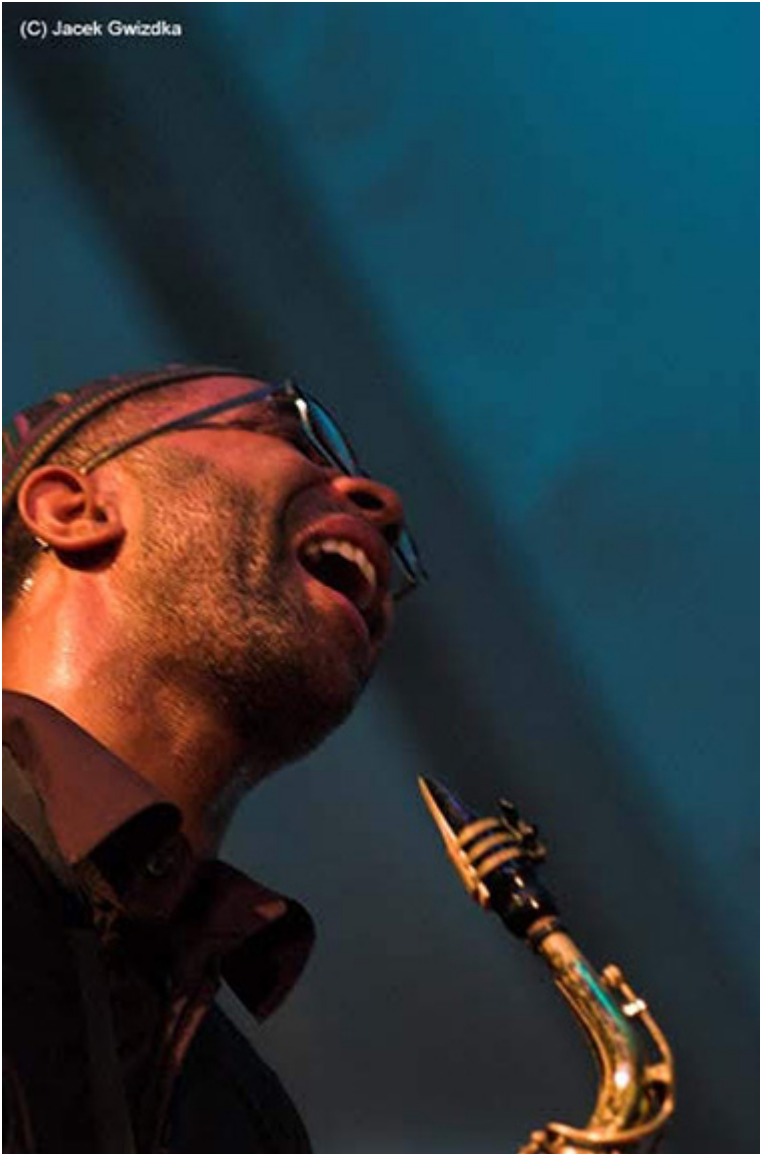
Kenny Garrett, Toronto, 2005.