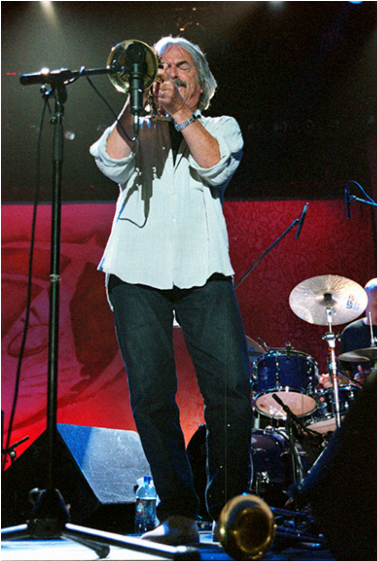
Enrico Rava, Montreal. 2001.