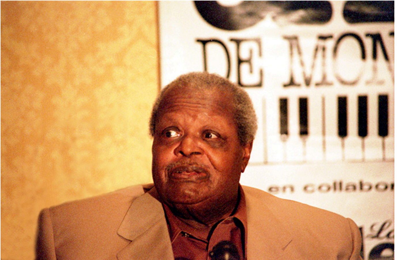
Oscar Peterson, Montreal, 2001.