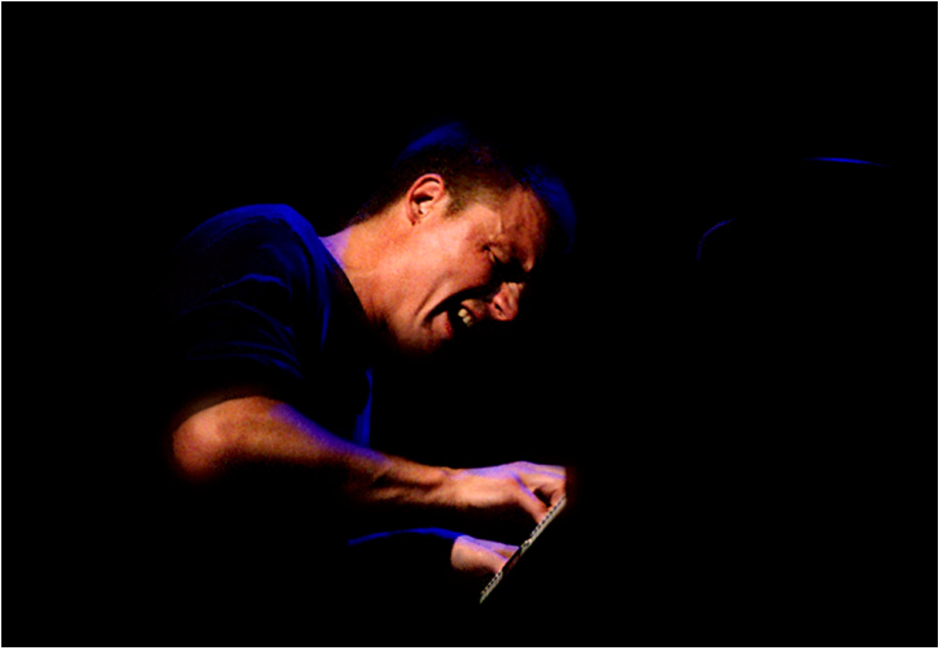
Esbjörn Svensson, Montreal, 2002.