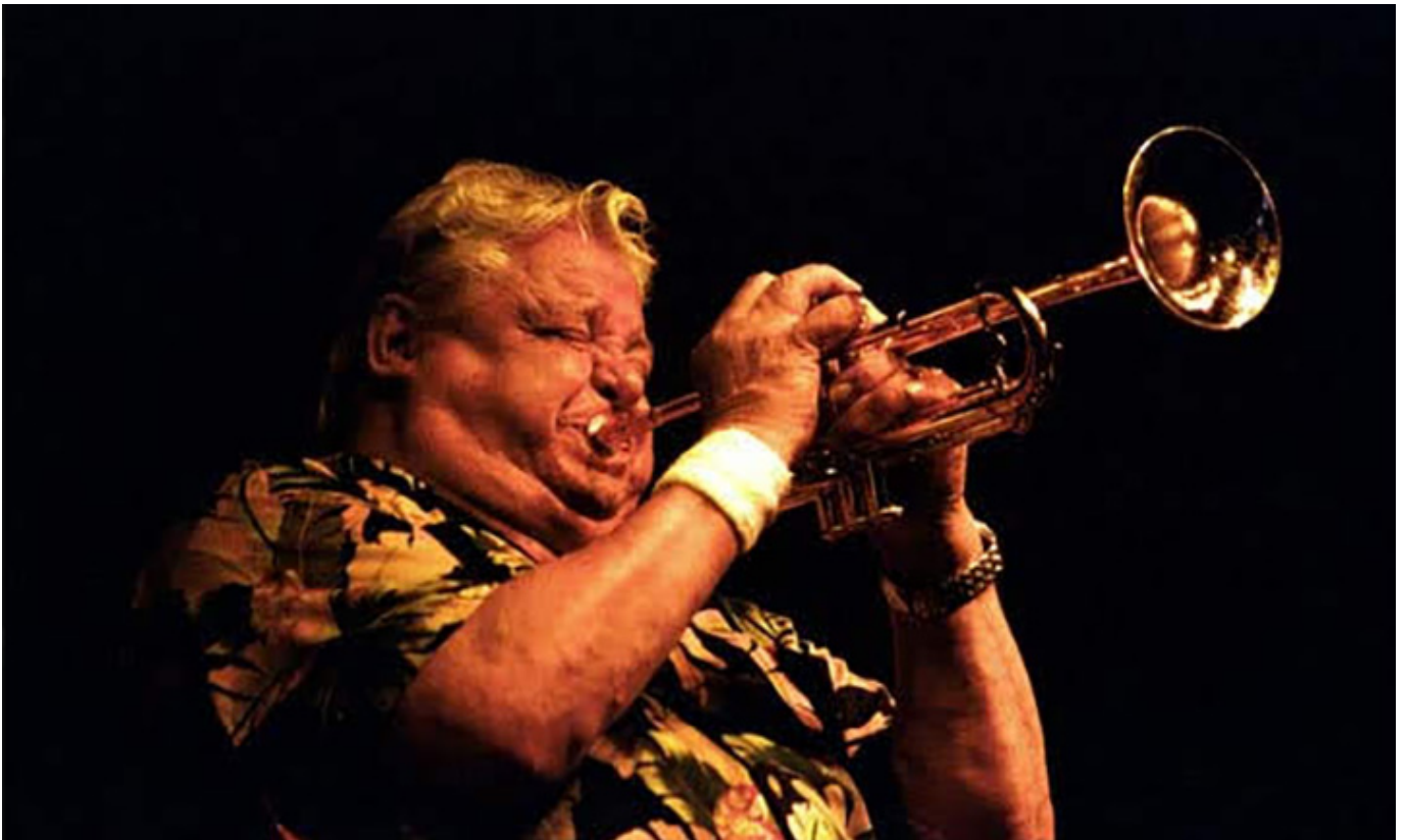
Maynard Ferguson, Toronto, 2002.