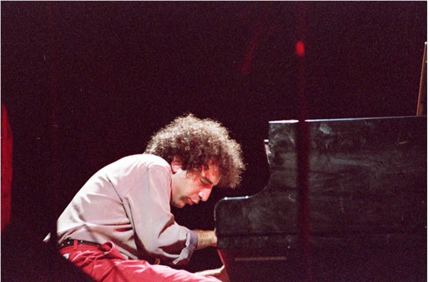
Stefano Bollani, Montreal, 2001.