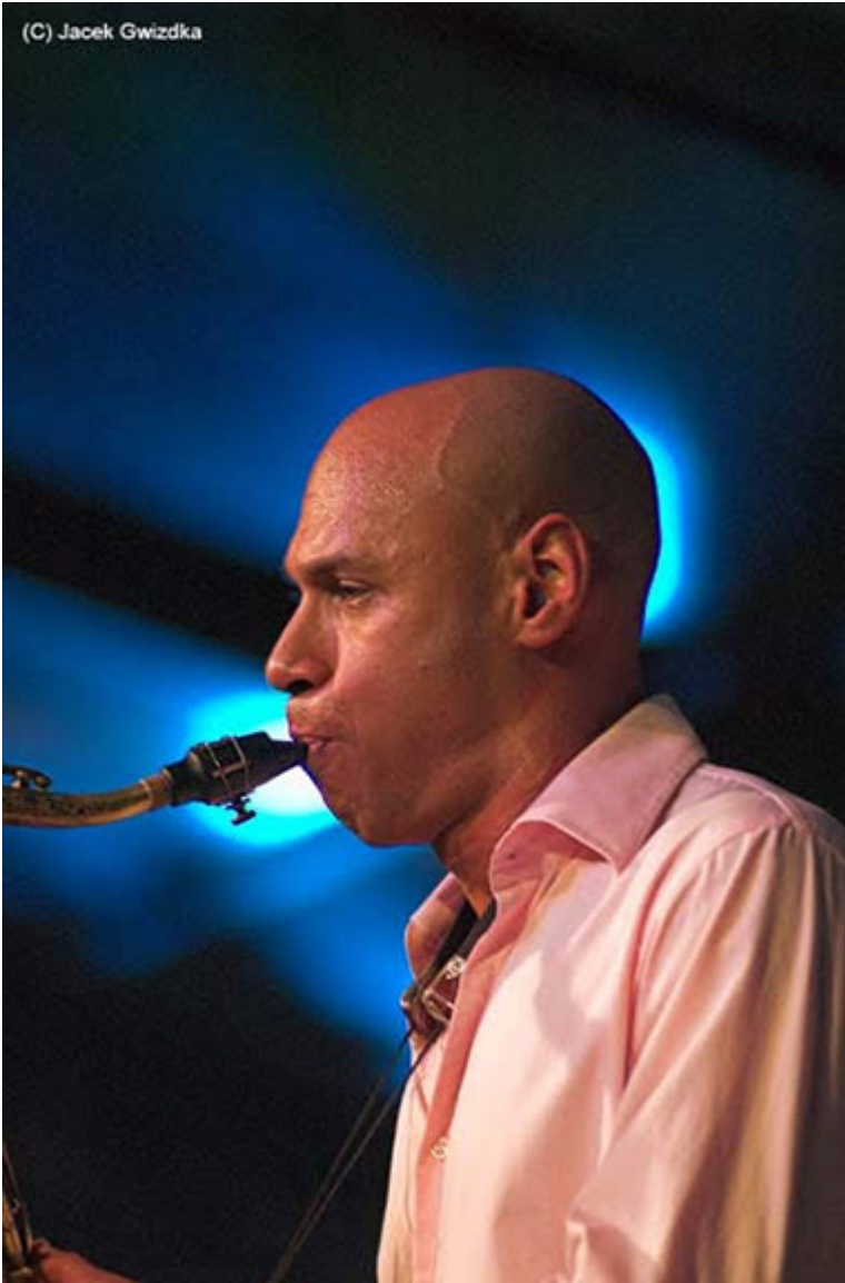
Joshua Redman, Toronto, 2005.