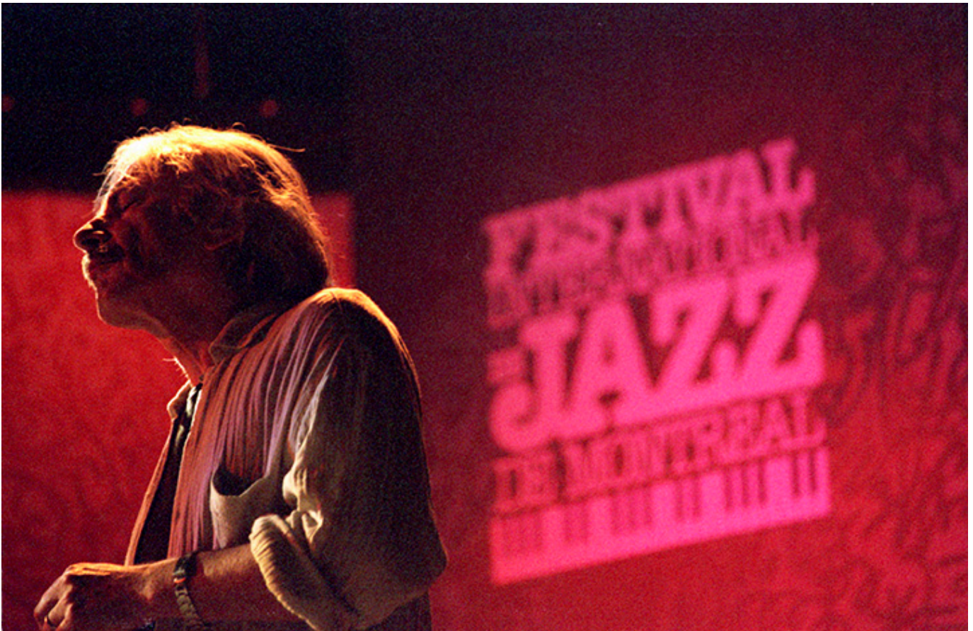
Enrico Rava, Montreal, 2001.

Jacek Gwizdka has been practicing photography for many years. The subjects of his photographs are fragments of architecture, reflections of light on the water surface, tangled tree branches forming a repetitive whole. The images form abstract shapes and surfaces, reminding the complexity of neuronal structures in the human brain.