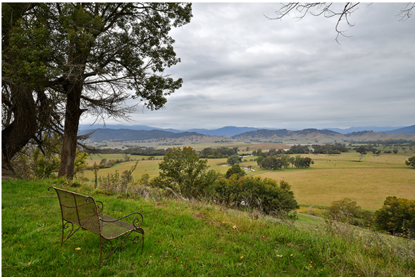
Ławeczka słynnej pisarki - Elyne Mitchell (autorki serialu „Silver Brumby”) na jej farmie na Towong Hill Rd Station, z widokiem na dolinę rzeki Murray. Jest to jeden ze szlaków P. E. Strzeleckiego