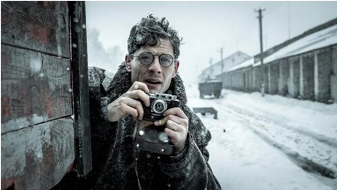
James Norton as Gareth Jones in Agnieszka Holland's film „Mr. Jones „(2019)