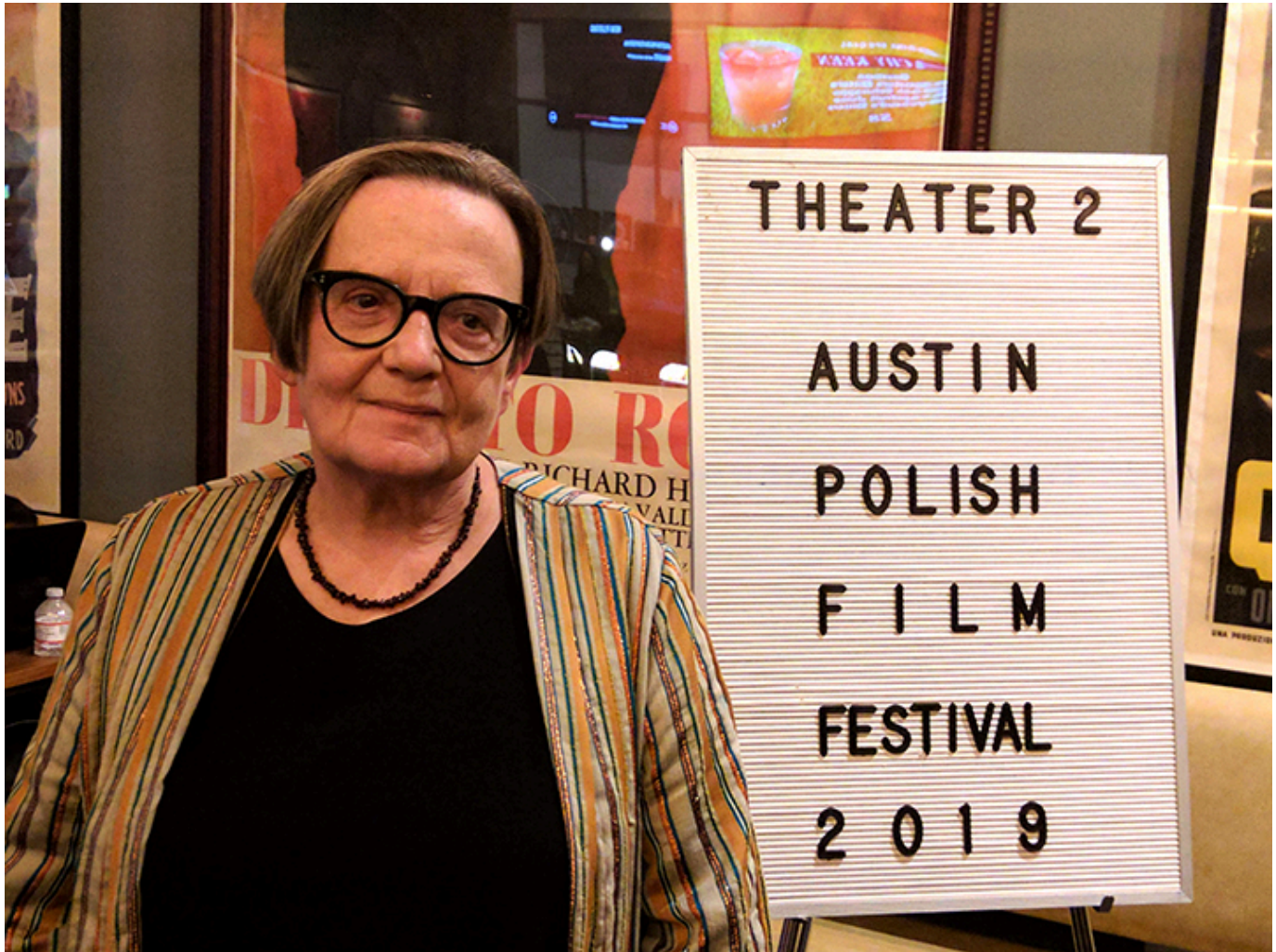
Agnieszka Holland

Interview with Agnieszka Holland about her film „Mr. Jones”