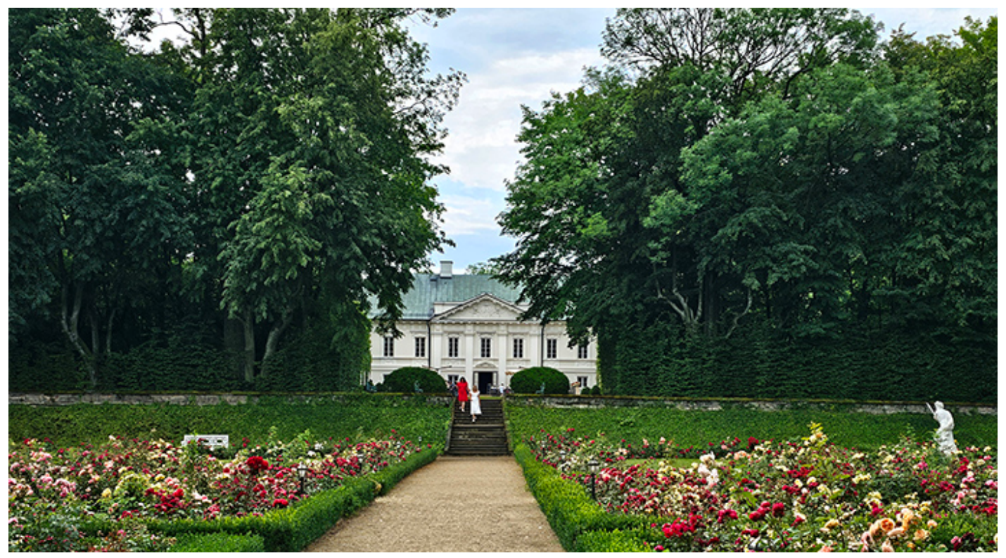
The Palace in Mała Wieś, near Grójec